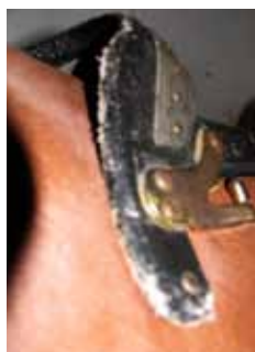
◀ Left: Wooden tree with the points contacting the horse 4 - 4.5 inches down. Note that the bottom of the tree point is not touching the horse and how it is pushing in on the wither muscle behind the shoulder. ▼ Below: Danny's proprietary tree with a wither point about 9 inches long. Notice how the bottom of the tree point makes contact with the horse and the top does not interfere with the shoulder rotation underneath it.

He further clarifies that if you take a bare horse and look at his shoulder hole while standing still, he might have anywhere from a shallow to a very deep shoulder hole. However, when the front leg is lifted and brought forward to create motion, the rotation of the scapula fills the shoulder. The traditional English tree, which is rigid and has the tree point flared off at the bottom, puts too much pressure at the top of the withers and fills the shoulder hole in. That's where the scapula needs to go. This creates an enormous amount of resistance as the shoulder is forced to work under the rigid tree. In this tree configuration, the tree points are not stable enough over a horse's withers. Consequently when the saddle is girthed down, the front